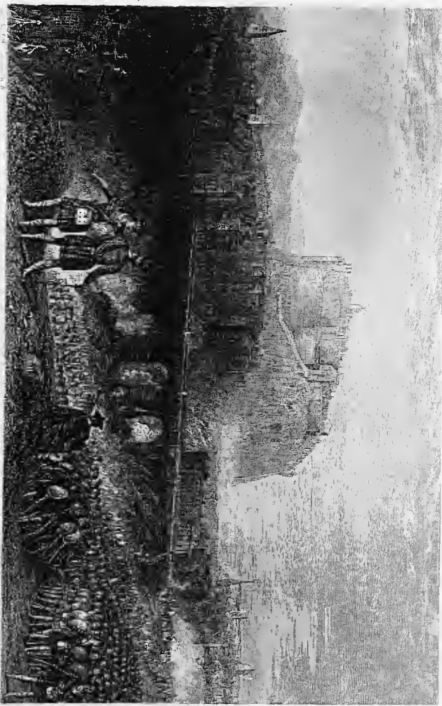
Edinburgh. View of the Finghlands